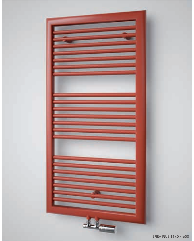
SPIRA PLUS 1140 x 600